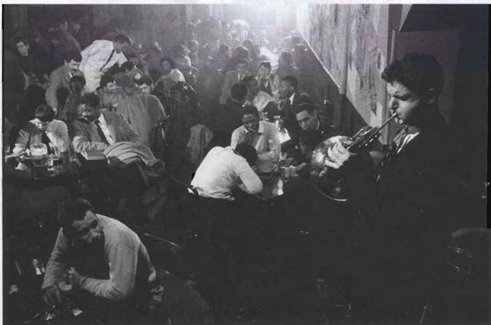
The Five Spot Café, New York, 1957.

WHEN I WAS A KID growing up outside Philadelphia, music was always there with me. Just being African-American, music was a thing that really got people through. There was a lot of music on the radio in Philadelphia, a lot of black stations. I began with rock 'n' roll, then moved on to jazz—Ornette Coleman and Coltrane. Sam Rivers, who died in 2011. That music was a real reach, because it wasn't easy to listen to. I used to go up to New York frequently, to Slugs or the Five Spot, but I was really young and didn't know quite what I was doing. I just felt that was where I wanted to be. I knew I was a painter, an artist, but I didn't know what that meant.